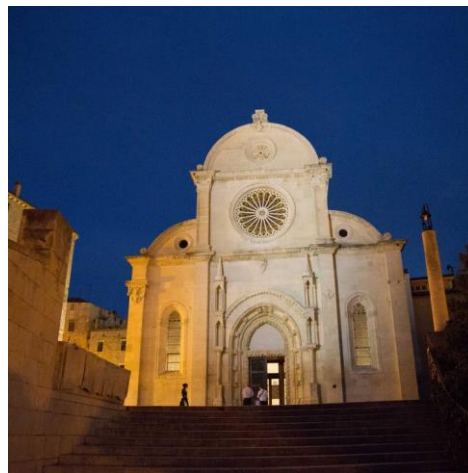
St. James' (or St. Jacob's) cathedral, Šibenik – UNESCO World Heritage Site

Further information on ukh@camping-croatia.com