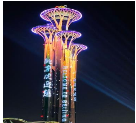
The Olympia Stadium in Beijing by night Definitely worth seeing!