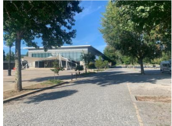
The free car park near the city centre is at your disposal